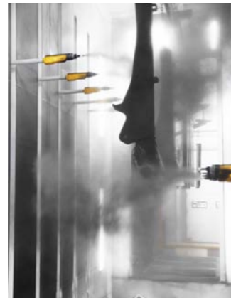
3. Painting (powder coating)