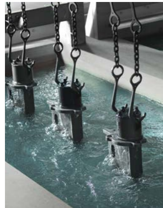
1. Nano pre-treatment

The backbone of the nDurance process consist of three different protective layers, each contributing to making your crane highly resistant to corrosion and the hardwearing environments that it is exposed to every day. Below the process is described step-by-step.